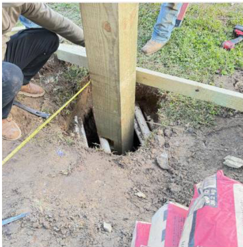
Setting the new deck area posts