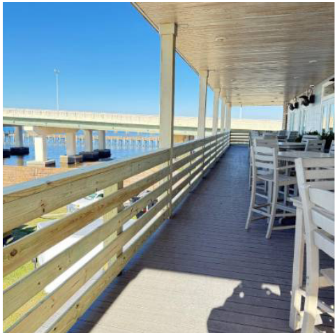
Completed handrail replacement