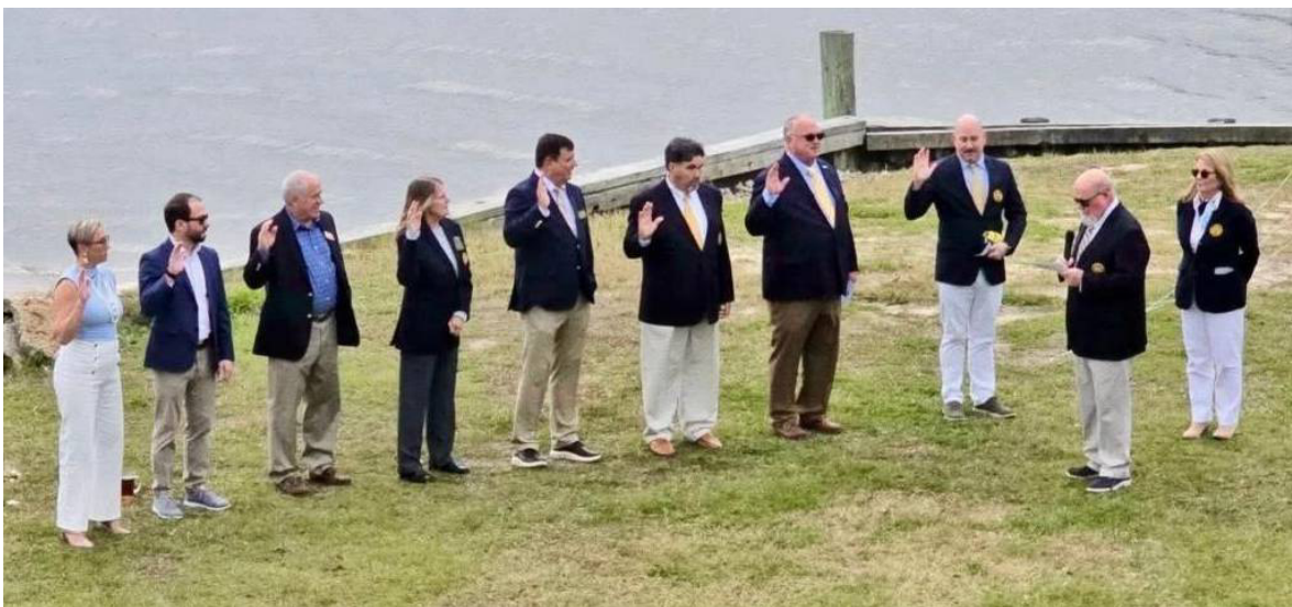
Swearing in of 2026 Board of Governors