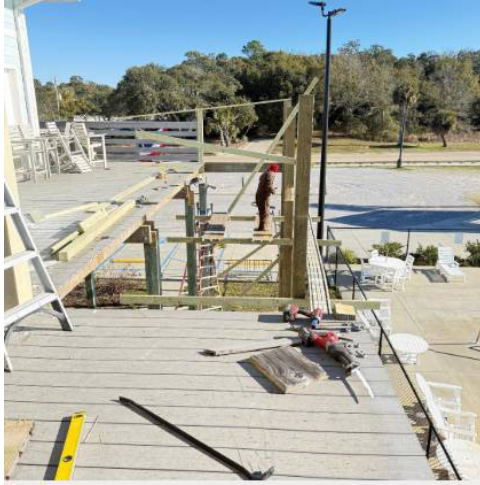
Deck repairs and addition

P.O. Box 821, Ocean Springs MS 39566 (228) 875-1915