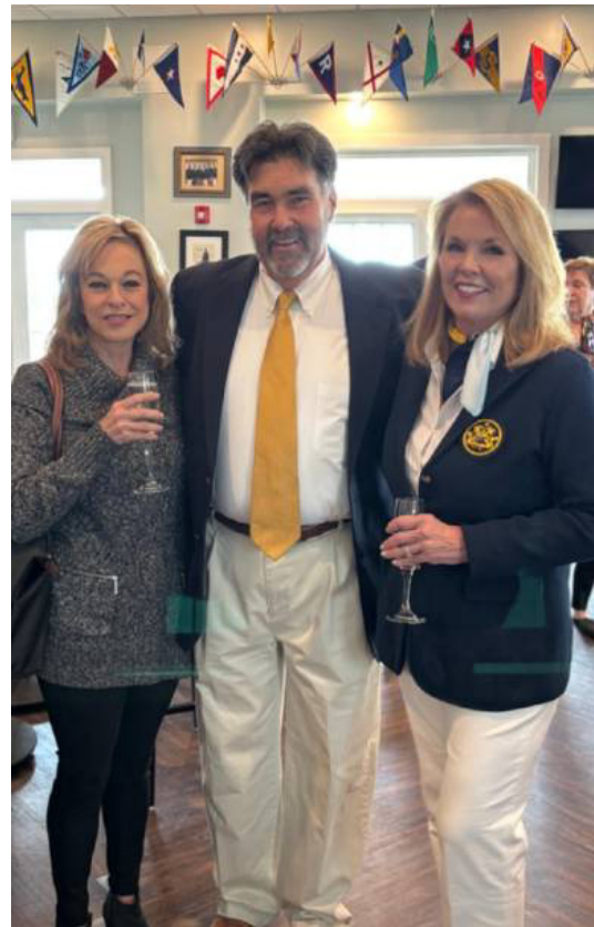
Flag officers relaxing after ceremony