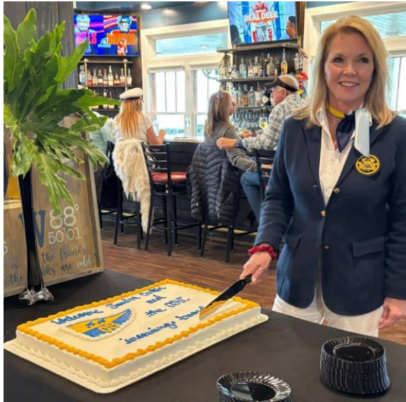
Cutting of the Change of Watch Cake

P.O. Box 821, Ocean Springs MS 39566 (228) 875-1915