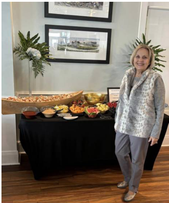
Our flower lady and the chilled menu items