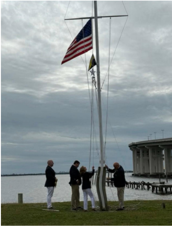
Change of Watch Flag Ceremony