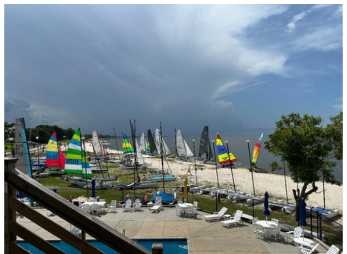
Offshore weather before start of Island Hop Regatta that led to not much wind on Day 1

https://www.wlox.com/2025/07/14/annual-horn-island-hop-regatta-sets-sail-ocean-springs/