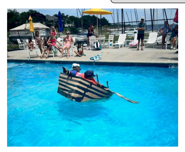
Best sinking, 2025 Cardboard Boat Regatta