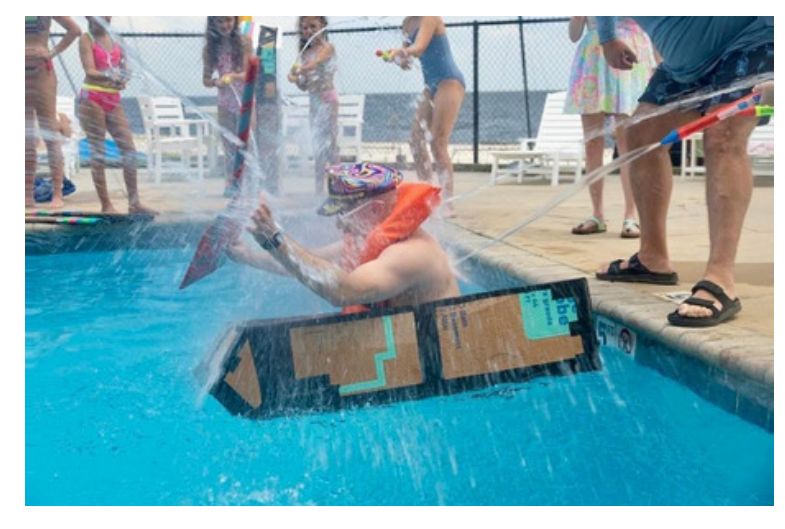
2025 Soaking of the Commodore