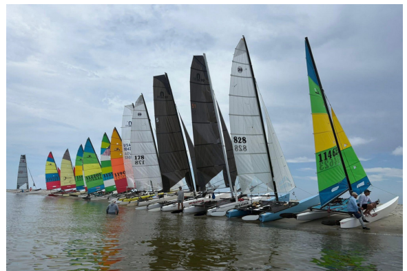
Catamarans on the beach, Slip to Ship 2025