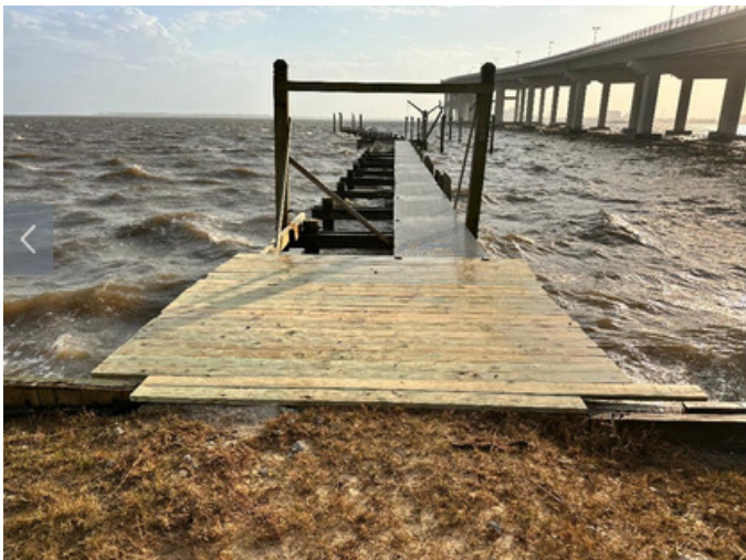
New decking installed