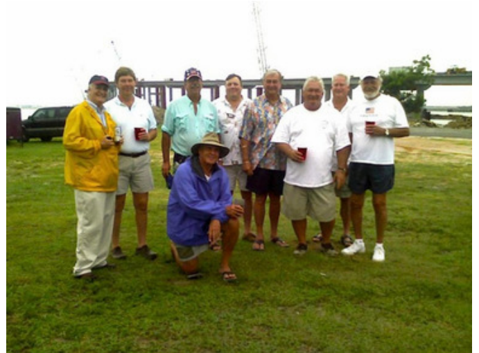
Club members gathered at old Club site post-Katrina