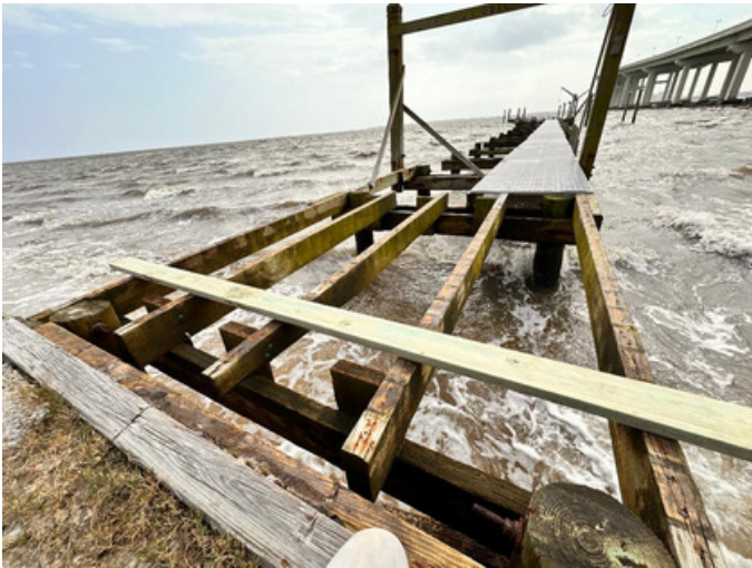
Old decking on pier landing removed

Club pier repair work and boat yard preparation for the 2025 sailing season began during the second week of February. The beach area was readied for use by our sailors, and the OSSS (labor) is beginning phase 3 of pier replacement with repair of the landing portion. Materials used were paid for by the Club along with the marine grade lumber used to replace the front stairs. It was very breezy with rough seas, but our Sailing Squadron guys prevailed and to the beach and pier work done.