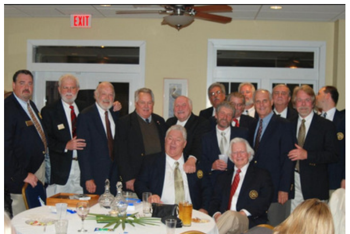
Commodores at the new Club for a formal event