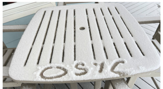
Snow at the Club