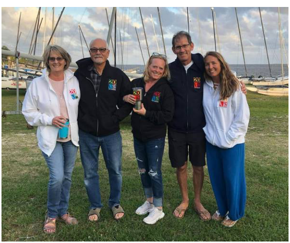
2024 Ocean Springs Sailing Squadron