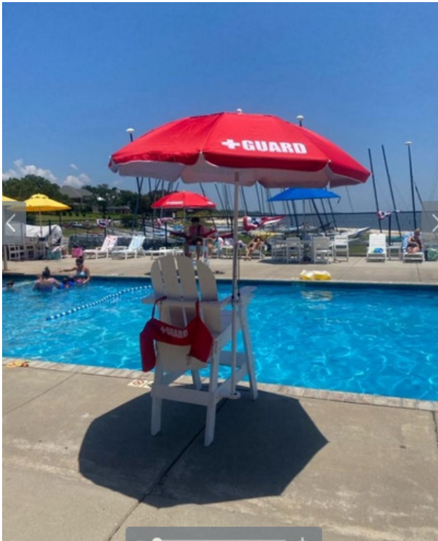
New lifeguard umbrellas