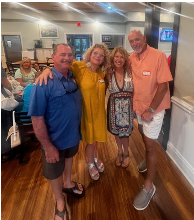
New Members Welcome Event