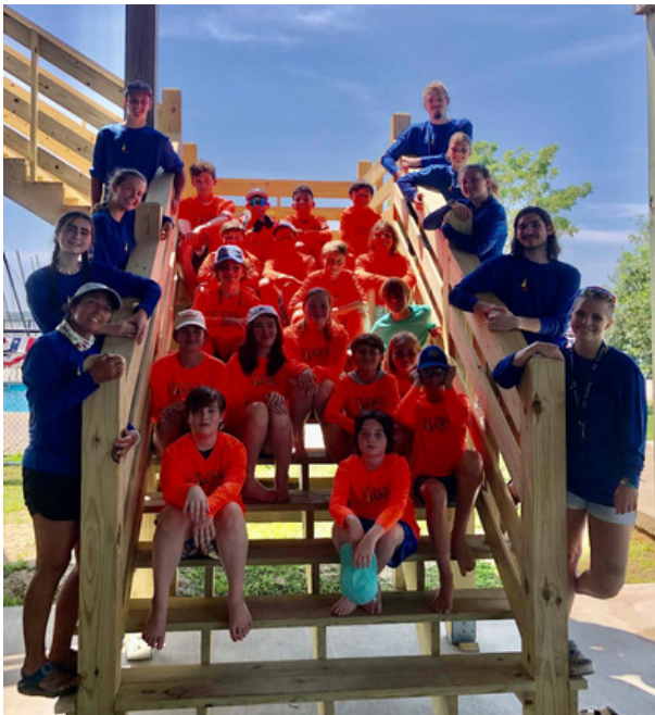
First Adventure Camp

Sail Camp Success In other exciting news, we've kicked off our first week of sail camp, and it's been an incredible success! The enthusiasm and energy from our young sailors have been truly inspiring. We are thrilled to report that our first two beginner sessions are overbooked, highlighting the growing interest in sailing within our community. For those who haven't had a chance to sign up yet, there is still room available for the July Camps. Don't miss out on this fantastic opportunity to learn and enjoy the sport of sailing.