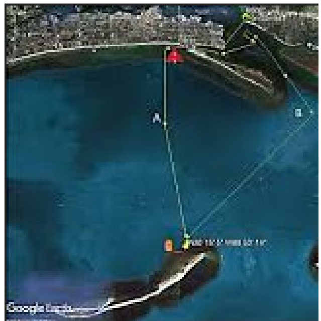
Slip to Ship sailing course