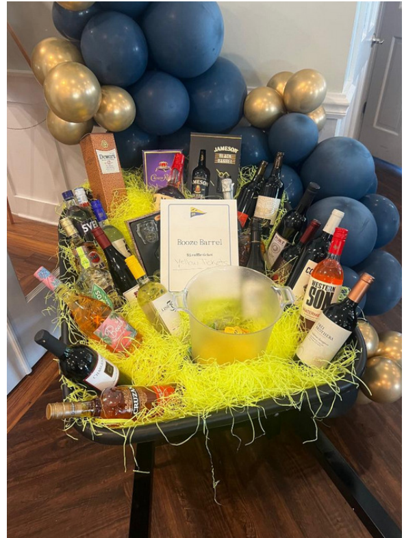
Booze Barrel for Drawdown