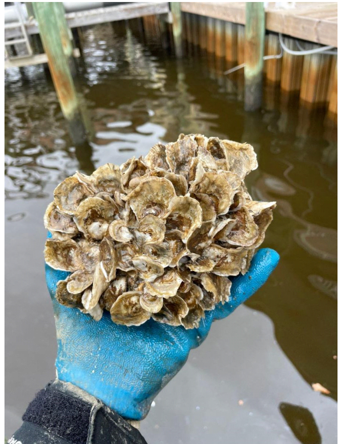
Typical oyster floret grown in a Mississippi oyster garden

Missy Partyka OSSS Board Member and AUMERC Extension Faculty