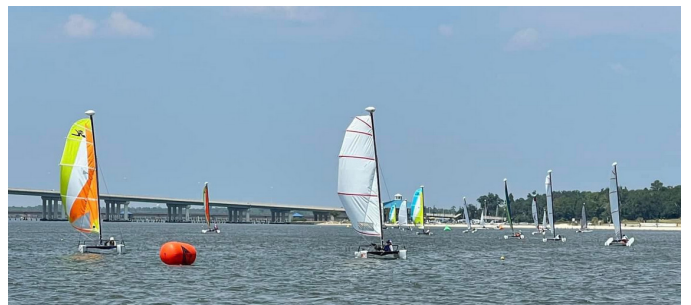
Katrina Memorial Regatta and Club Wave Championship