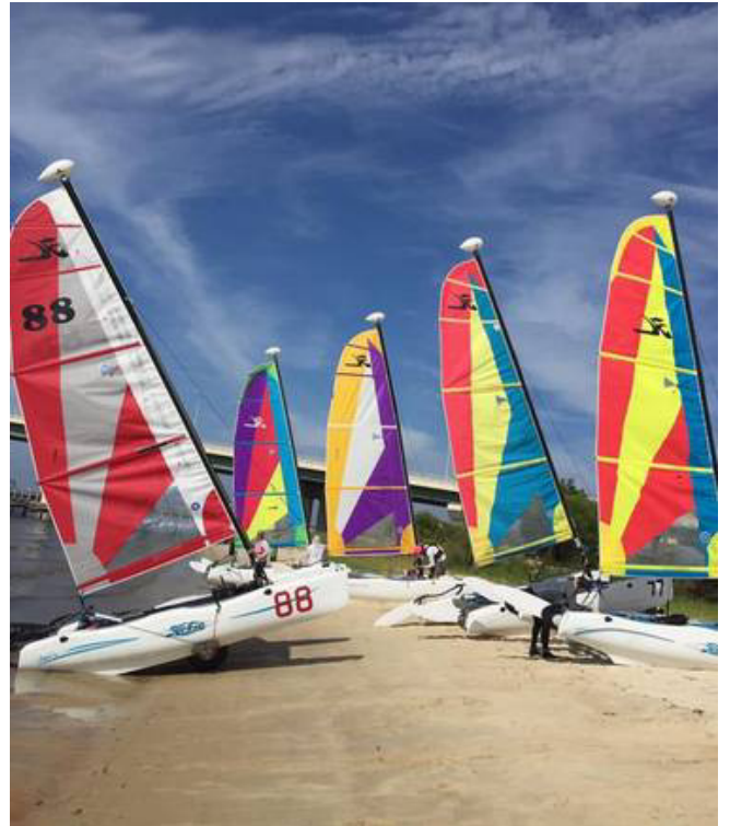
Hobie Waves on the beach at the Club