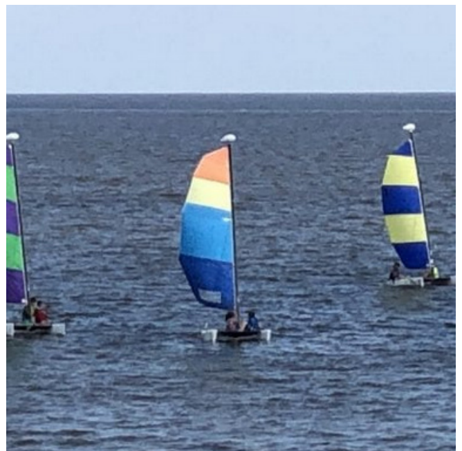
Hobie Waves on the water in Mississippi Sound