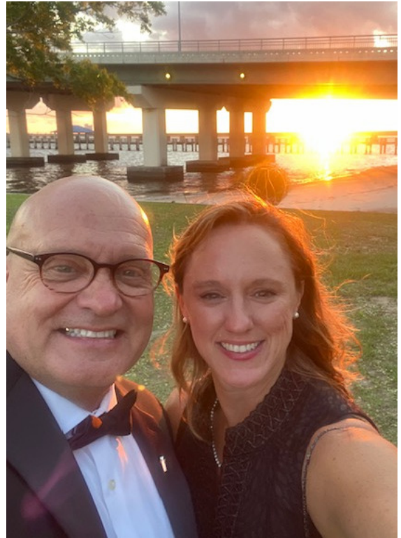
2021 Commodore's Ball

Remember to check your email for "This Week at the OSYC" for special updates.