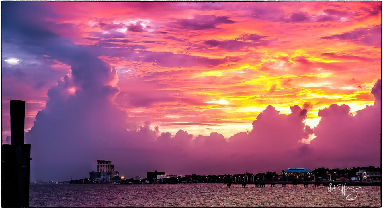
“Compliments of Hurricane Barry!”

For additional pictures from events at the OSYC, please visit the OSYC Facebook page: